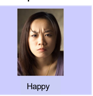
Decide within 3 seconds if the photo's facial expression matches the emotion of the words; 48 questions total.